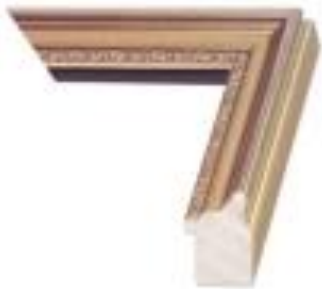
Tarnished Gold (78832)